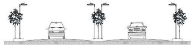
Fig.3: A section View for Shuhada Road [19]

Shuhada Road is a main two directional road; as shown in figure 3. Each direction has four lanes with a total width of 10m. There is a pedestrian sidewalk on the right side of each direction with a total 1 meter width and 20 cm height. Moreover, there is a landscape strips that cuts the street into two directions with 1m width and 20cm height as shown in figure 3.