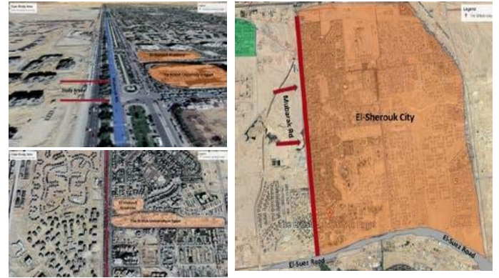
Fig.2: The location of Shuhada Road [16].

The study area of this research is Shuhada Road. This road used to be called Mubarak road which was named attributed to President Mubarak, the name of the road has been change to Shuhada Road after the Egyptian revolution in June 2013 which means Martyrs. Shuhada Road located in El-Sherouk city, Cairo-Egypt. Shuhada Road has been chosen to be the study area of this research due to the availability of data and because it is a crowded road that links Ismailia-Cairo desert road with Sues-Cairo desert road, Shuhada Road is considered the main road in El-Sherouk city, knowing that El-Sherouk city is one of the most crowded new suburbs in Cairo, it includes many public facilities, the most important facilities in this suburb is the two private high educational facilities which are “the British university in Egypt (BUE)” and “El-Sherouk Academy” and both of them are located on Shuhada Road as shown in figure 2.