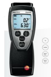
Fig.4. Testo 315-3

The Activity of vehicle will be measured by electrochemical sensor for CO measurement and a shock-resistant infrared CO 2 sensor. The instrument used (testo 315-3) is equipped to resist external influences by its robust design and the optionally available TopSafe, device is shown in figure 4. During the measurement, optical and audible signals shows immediately whether the variably adjustable limit values have been exceeded.