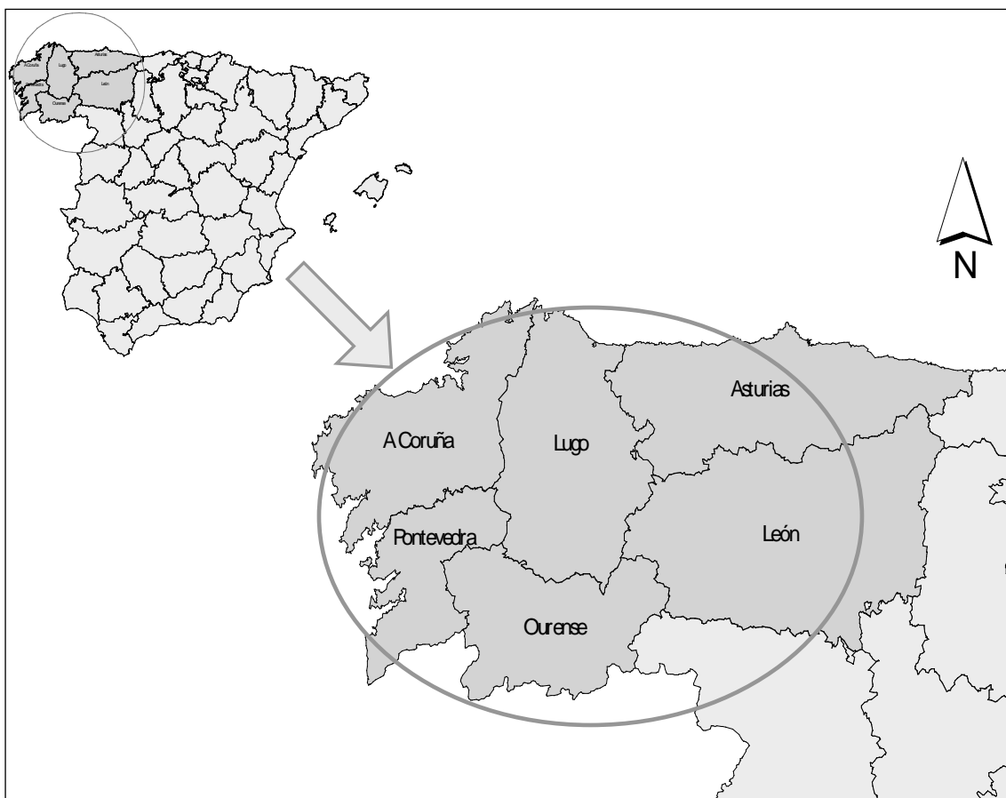
Figure 1. Location of the sampling plots in the study area within the Iberian Peninsula.