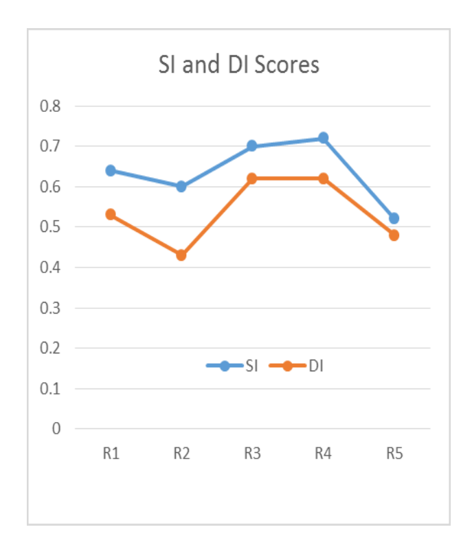
Fig.3: Comparison of SI and DI

and incidentally, are also the least of the requirements that dissatisfies users when unmet, R2 (43%), R5 (48%). This result also confirms the result of the self-stated importance rating of the requirements as the two requirements are the least important as perceived by the respondents.