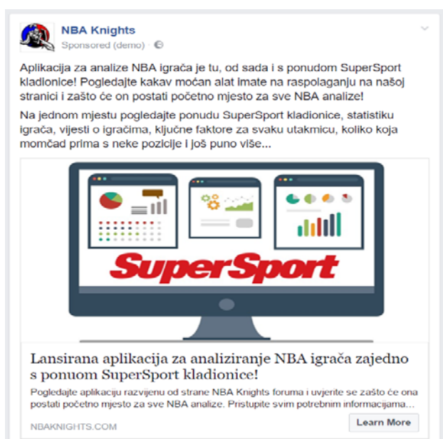
Fig.5. Ad example that was used in the research

Ad groups and audience selection for each campaign: