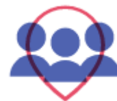
Fig.1. Core Audiences icon [7]

behaviours. These options are created manually based on the campaign requirements. (Fig.1.)