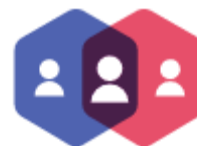
Fig.2. Lookalike Audiences icon [7]

Lookalike Audiences are based on people who are similar to the current customers or contacts as it increases the chance of reaching the right people who might be interested in the company's business. As this option is created and generated automatically from sources that the company has already uploaded or connected to Facebook, it shows a fast and effective way to expand the reach to potential new customers as current customers present a reliable source. In addition, it can also easily be tuned and adjusted for further marketing. (Fig.2.)