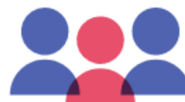
Fig.3. Custom Audiences icon [7]

As the main goal of this paper is to show the advantages of Website Custom Audience, we will focus on undertaking this tool and sources that are created by it. (Fig.3.)