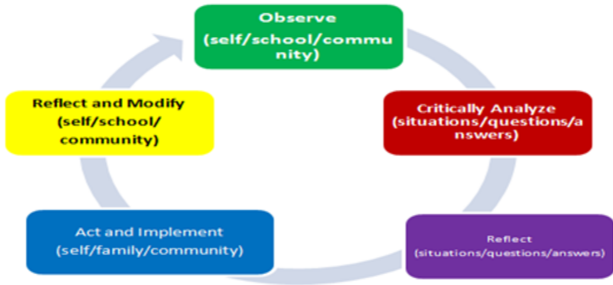
Figure 2. Reflective Critical Thinking Cycle

interested students and facilitators if analytical thinking skills are taught separately, such as the leadership skills worked out in the college under review. For this reason, as shown below, a Reflective Critical Thinking Cycle in Environmental Education was created: