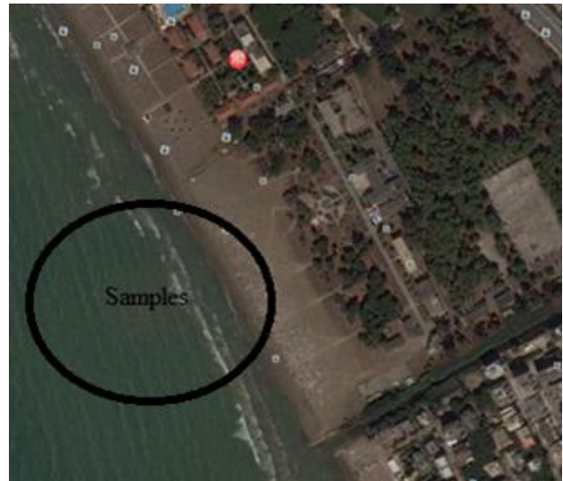
Figure 2 Plepa beach monitoring, Satellite Google map