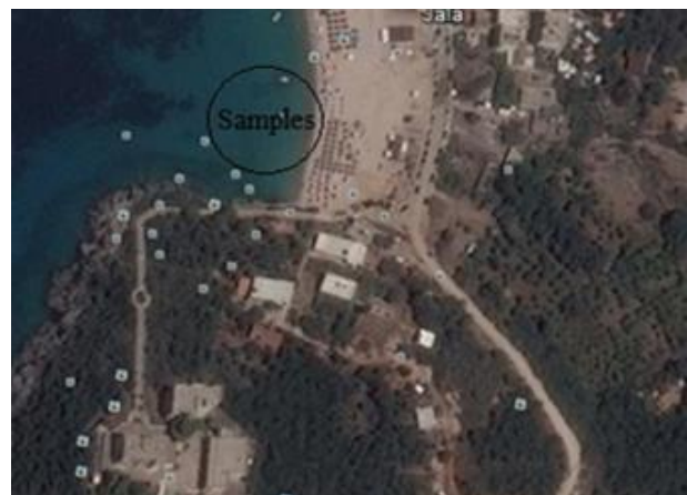
Figure 3 Jala beach monitoring, Satellite Google map