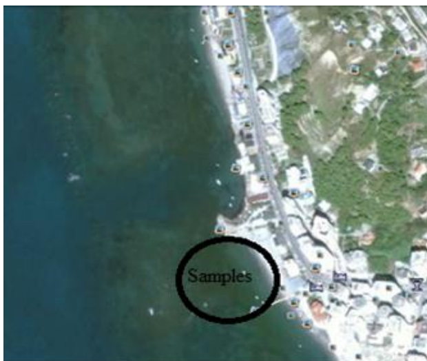
Figure 1 Currila beach monitoring, Satellite Google map