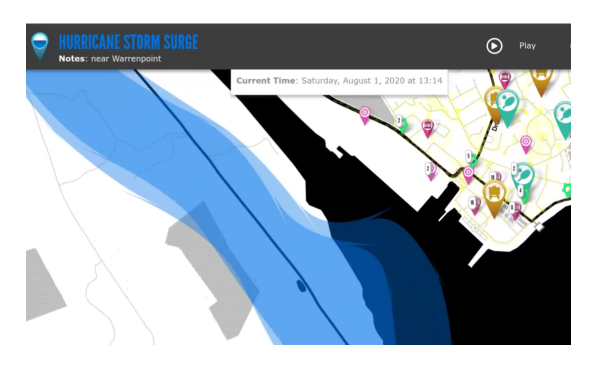
Figure 3: An ORP natural disaster simulation

have utilized machine translations especially in cases of categorical data where these are non-contextual descriptive text. There is also a dearth of latitude and longitude data. We have looked at incorporating certain OpenStreetMap data to compensate, but ideally greater public data from KSA official sources would be preferred. Another element of localization presents itself here—data is often in local coordinate systems, for instance in Northern Ireland (our other test region), where the frame of reference for local data is the Irish grid. This means data must be converted to and from global coordinate systems transparently, to prevent this being a concern of the numerical model.