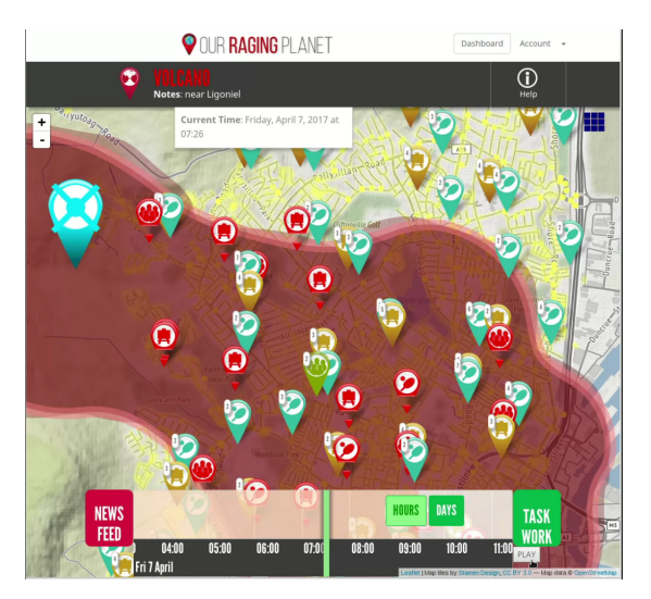
Figure 1: Screenshot of the OurRagingPlanet interface

ographical or data region and fixed known formats. The object toolbox provides simplified, studentfriendly layer management—primarily, enabling and disabling open dataset visibility—allowing users to experiment in a layout representative of their real, local environment.