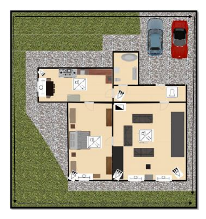
Fig.2 Proposal of measures.

The electromagnetic detectors also include infrared barriers, microwave detectors, radio barriers and detectors, capacitive detectors and laser detectors. [2,3]