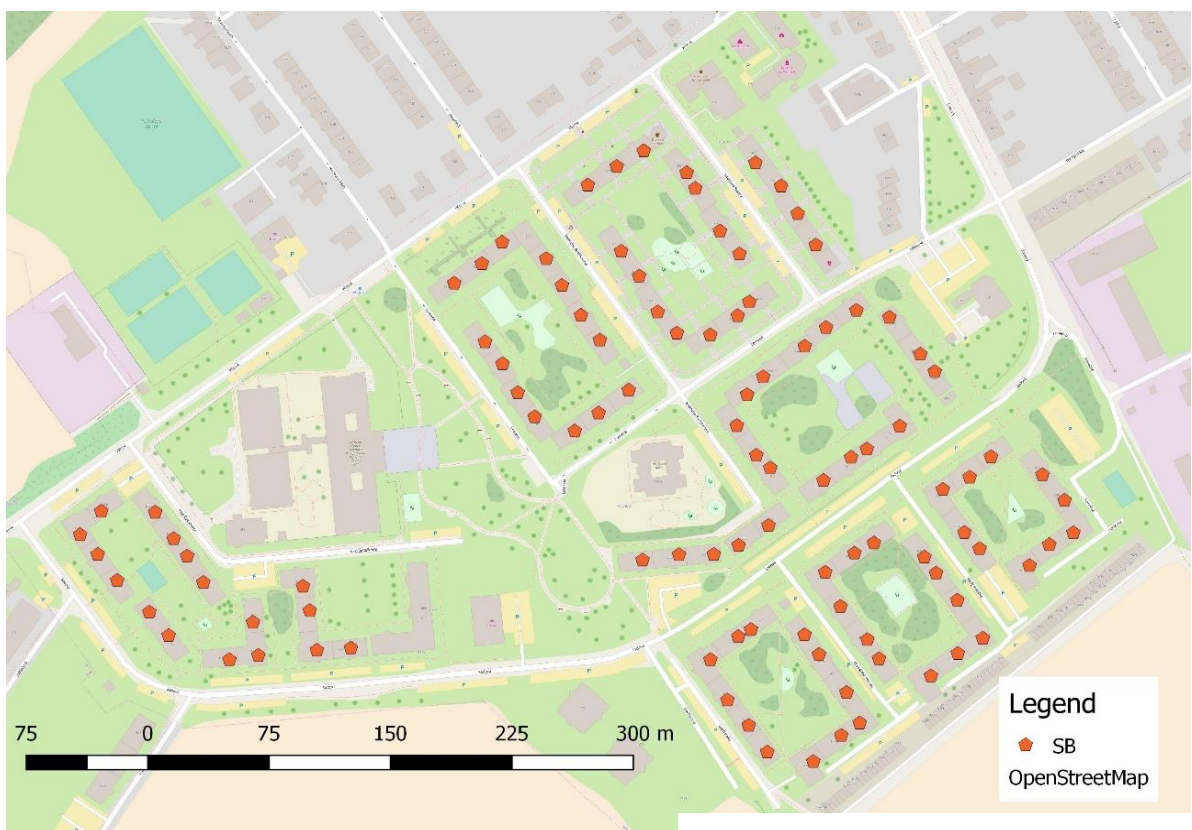
Fig. 3. The detail of data model in the GIS application