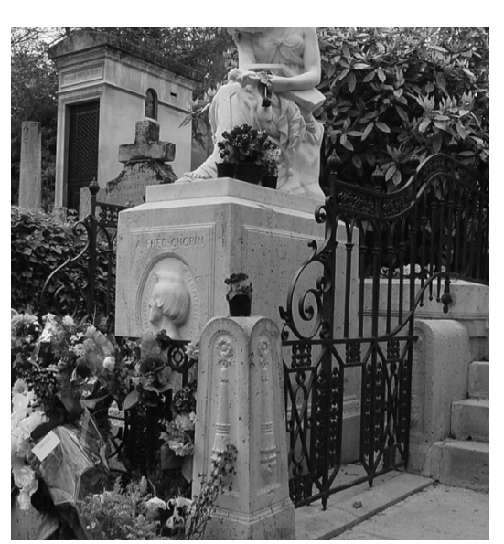
Figure 1. The gravesite of Chopin with sculptures, carving portrait of Chopin, fences, and fresh cut flowers from visitors in Pere Lachaise Cemetery, Paris, France. (Copyright ©2005 Jon Bryan Burley all right reserved used by permission).

name for – a kind of burial place that triumphed whatever the new bourgeois civilization of the nineteenth century triumphed or hoped to triumph" [2]. Pere Lachaise became a popular place for visitors, because it was fascinating to see the huge contrast between Pere Lachaise and old-style western burial custom that existed prior to Pere Lachaise in Paris and other European Countries [1]. Every other place wants a burial space like Pere-Lachaise, but the cemeteries are not meant to be the exact copy of Pere-Lachaise instead they are all supposed to have their own unique identities based on the different local context of each place [2] (Figures 1 and 2).