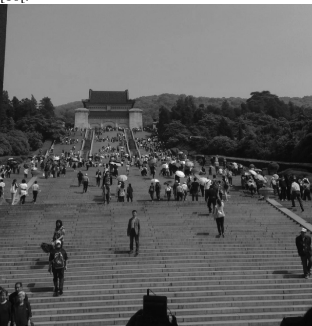
Figure 4. Dr. Sun Yat-sen's Tomb in rectilinear design with massive stair cases and naturalized landscape. (Copyright ©2017 Zeran Zhu all right reserved used by permission).

In the Chinese tradition, it is very important to maintain the ancestral grave sites, which is a burial site with many mount shape graves in family order on hillsides [9]. Even the traditional rural Chinese graves in the mountain villages try to follow the principle of Fengshui if possible. According to Li, a graveyard with good Fengshui should be located by a mountain, near rivers and with an open view, because good Fengshui will bring good luck to the dead in his or her after life and next life [10]. In addition, the location or Fengshui of a graveyard determines the fate of the deceased's offspring [10].