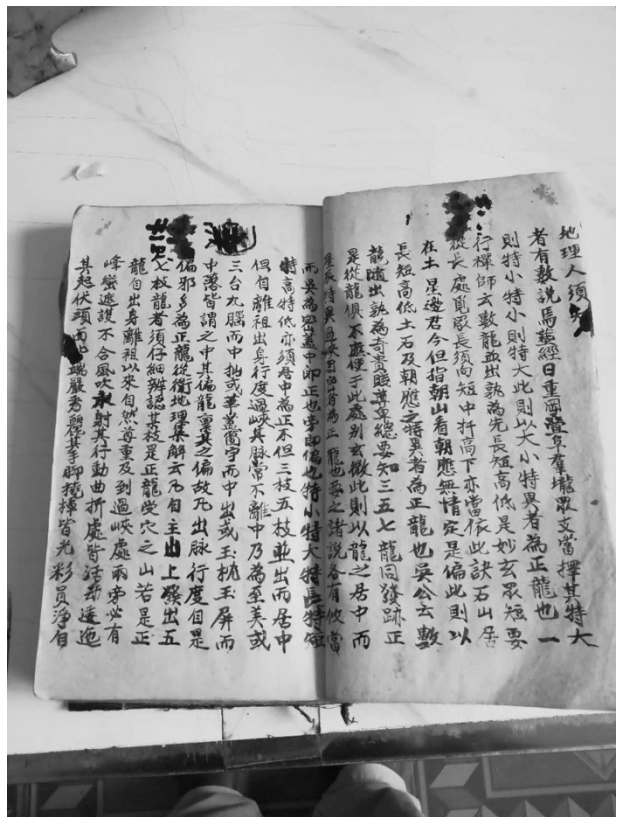
Figure 13. An image of the Qiu's family hand transcribed copie.

The Hufsixkar people were first recorded and identified in books as "Tu" during the end of Tang dynasty and the beginning of Five dynasties and Ten kingdoms (907-960) periods. Until the Qing dynasty on the local books they called themselves "Tujia". Hunan Province, Hubei Province, Guizhou Province and Chongqing are their traditional residence area (100 thousand square kilometers in the Dalou Mountains and Wuling Mountains). They usually built their houses by the mountains or by the rivers. Hunan presently has the most Tujia population. For centuries they developed their own culture, religious and dialect (Bizisa/ Bidjisa/ Husisa/ Humasa) but they have no texts. So in a big Tuija residence area the family who understood old Chinese text would be well respected by local people.