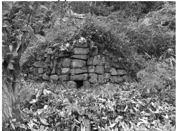
Figure 15. Another burial tomb with no door/doorway. (Copyright ©2017 Xianqing Ding all right reserved used by permission).

Figure 14. Youshan Huang's burial tomb. (Copyright ©2017 Xianqing Ding all right reserved used by permission).