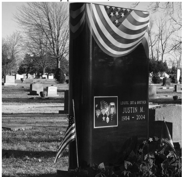
Figure 6. Gravestone with portrait, USA flag carving, and memorable in the Little Arlington Veteran Section in Evergreen Cemetery,