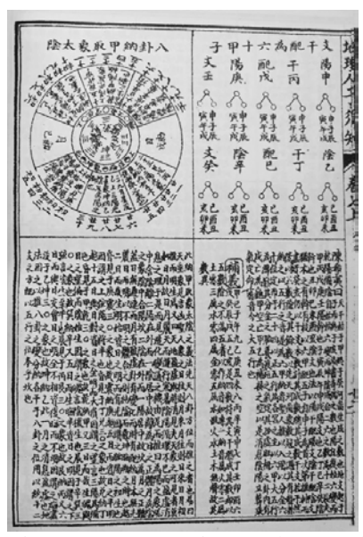
Figure 12. Drawing and text of Taiji and Bagua used in Taoist cosmology from a version from Xu, Shanji (徐维志(善继) and Xu, Shanshu (徐维事(善述), Geography Everyone Should Know (地理人子须知 pinyin: dìlǐ rén zǐ xūzhī), undated, [Ming Chinese, non-simplified Chinese], text, Copyright © expired.