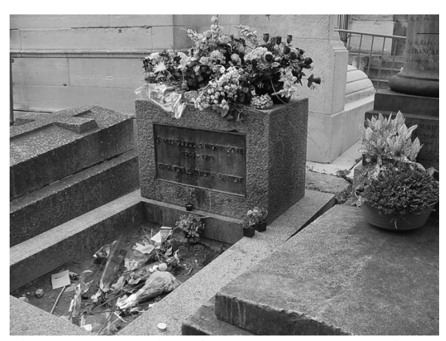
Figure 2. Gravesite of James Douglas Morrison with fresh cut flowers from the visitors in Pere Lachaise Cemetery, Paris, France. (Copyright ©2005 Jon Bryan Burley all right reserved used by permission).

Pere La Chaise is the "predecessor" of Parisian style American cemeteries such as Mount Auburn in Boston established in 1831 and Greenwood Cemetery in Philadelphia established in 1838 [1]. Even though the number of monuments have increased dramatically in Pere Lachaise, making the cemetery over crowded with monuments, and not much effort has been put on maintaining the picturesque quality of the cemetery [1]. Pere Lachaise is in fact always the start of modern rural cemeteries that gives many other English and American cemeteries inspirations on how to design develop picturesque, nature-oriented environments [1].