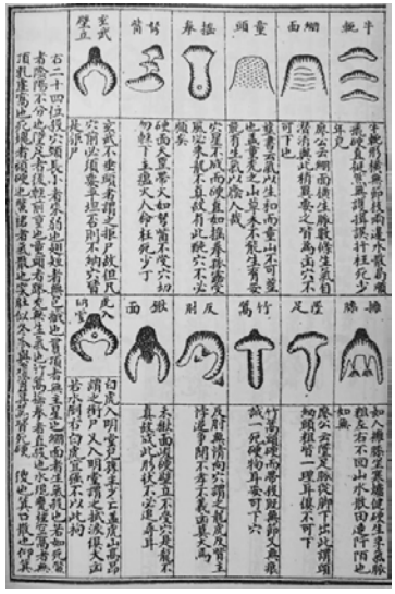
Figure 11. Another image from a version from Xu, Shanji (徐维志(善继) and Xu, Shanshu (徐维事(善述), Geography Everyone Should Know (地理人子须知 pinyin: dìlǐ rén zǐ xūzhī), undated, [Ming Chinese, non-simplified Chinese], illustrating additional fengshui graphics and text, Copyright © expired.