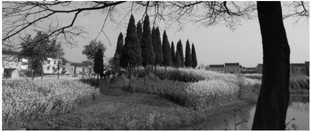
Figure 8. Xu's rural ancestral burial ground consisting group of bare dirt mound graves with arborvitae trees in agricultural field facing river.