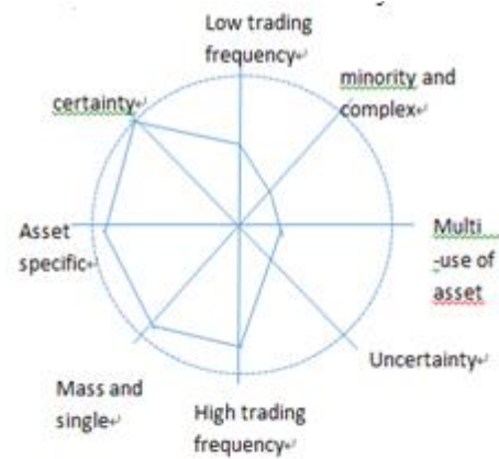
a: the transaction cost of Formal organizations

Figure 1(b): the transaction cost of Informal transaction cost