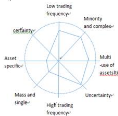
b: the transaction cost of Informal organizations