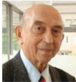
Professor Lotfi A. Zadeh

Professor in the Graduate School, Computer Science Division Department of Electrical Engineering and Computer Sciences University of California Berkeley, CA 94720 -1776 Director, Berkeley Initiative in Soft Computing (BISC)