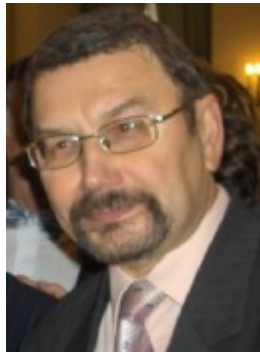
Image Processing and Recognition for Human Identification. Biometrics and Forensic Applications